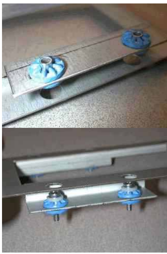
STEP 3: Turn the bracket over and insert the (4) 1/2" Long screws thru the white plastic spacers and into the metal standoffs in the blue Grommet.